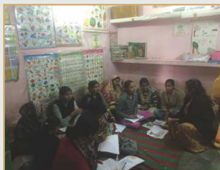
Focus group discussion with girl students who attend remedial classes at one of NFAC's Gender Resource Centres (GRCs) in Delhi. The discussion with community beneficiaries, held in December 2015, focused on assessing the impact of GRCs and establishing the best way forward