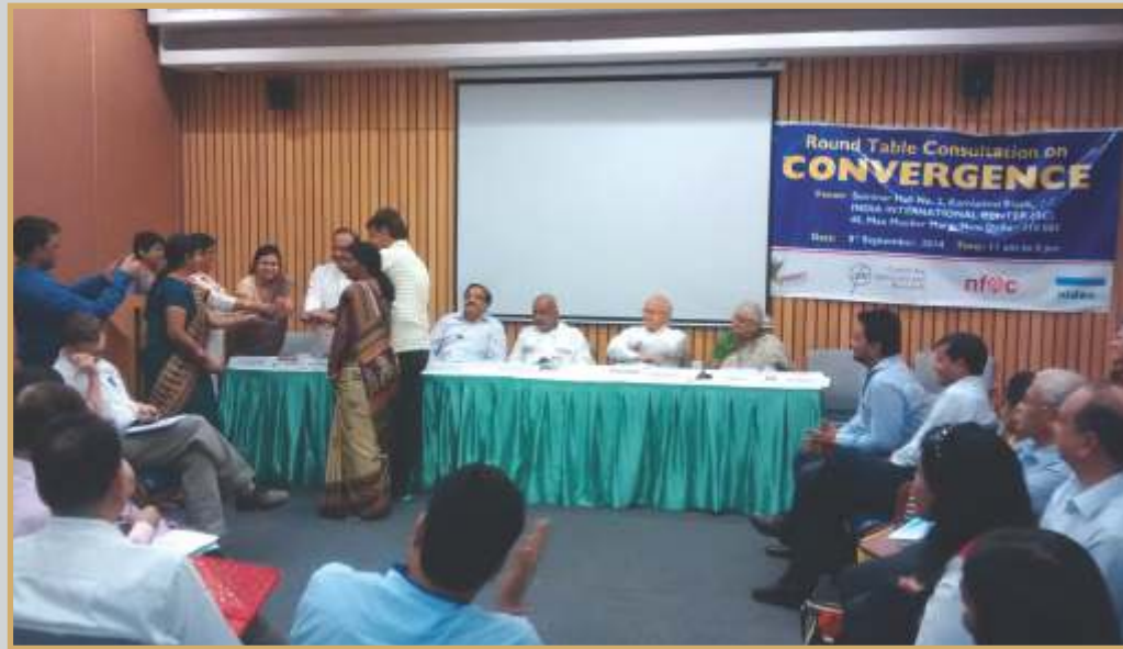
Round table consultation on sharing good practices on convergence and their role in informing NFAC's agenda including the release of the NFAC brochure at IIC, Delhi, 8th September 2014