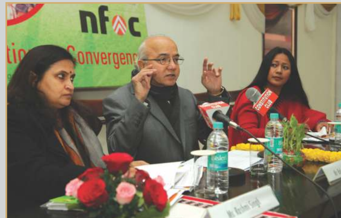
Glimpses from the Convergence ThinkFest 2014 (left: Mr Suresh Prabhu, Minister of Railways, lighting the lamp). The theme of the ThinkFest was 'Institutionalising Convergence for Effective and Inclusive Governance, From What to How' and it was held at Constitution Club of India, New Delhi, 26 December 2014.