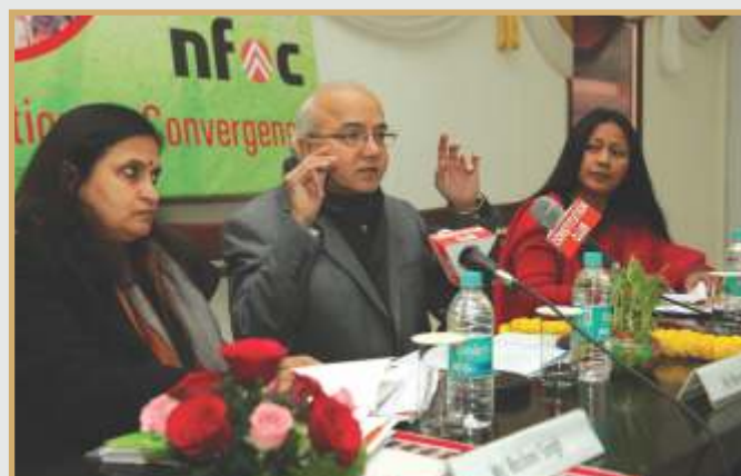
Glimpses from the Convergence ThinkFest 2014 (left: Mr Suresh Prabhu, Minister of Railways, lighting the lamp). The theme of the ThinkFest was 'Institutionalising Convergence for Effective and Inclusive Governance, From What to How' and it was held at Constitution Club of India, New Delhi, 26 December 2014.