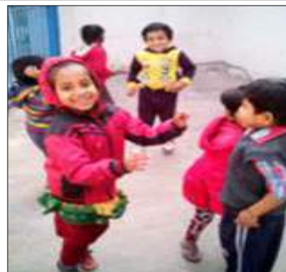
ECD/ REMEDIAL EDUCATION