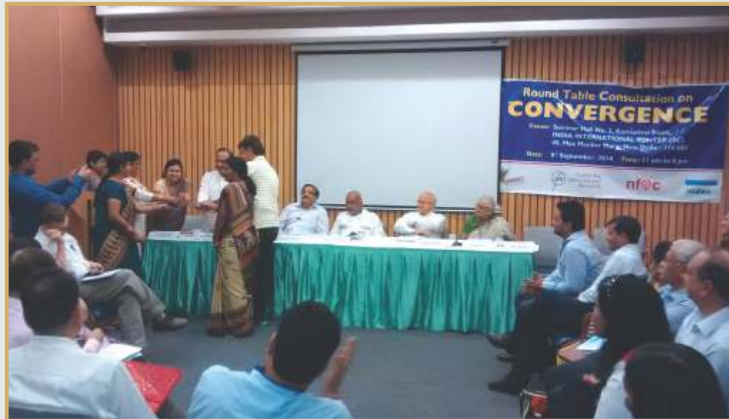
Round table consultation on sharing good practices on convergence and their role in informing NFAC's agenda including the release of the NFAC brochure at IIC, Delhi, 8th September 2014