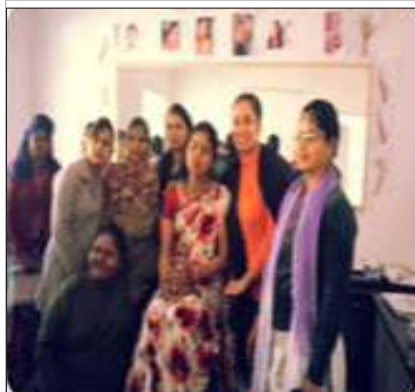
BEAUTY & WELLNESS