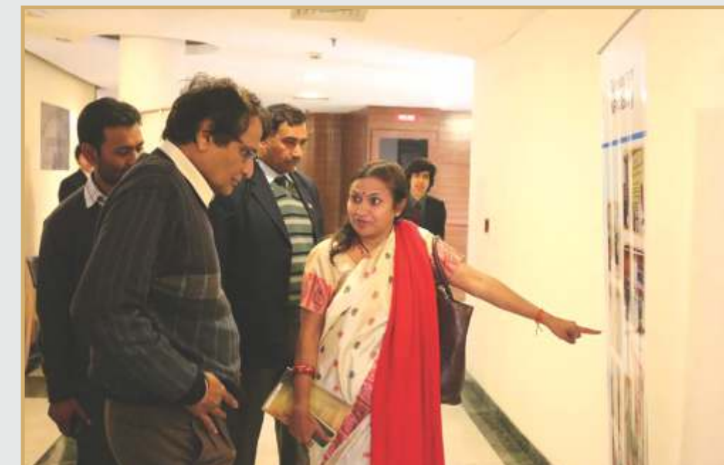
Release of the book 'Women 'Road to Rights- Women, Social Security and Protection in India' by Minister of Railways, Suresh Prabhu, at an event organised by the Programme on Women's Economic, Social and Cultural Rights, in collaboration with the NFAC at the Indian Islamic Centre New Delhi on 27 January 2016. The book includes a chapter on ' Women and social security: Convergence model of delivery' by NFAC National Convenor, Rashmi Singh.