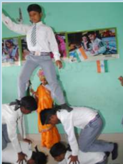
15th August Celebration