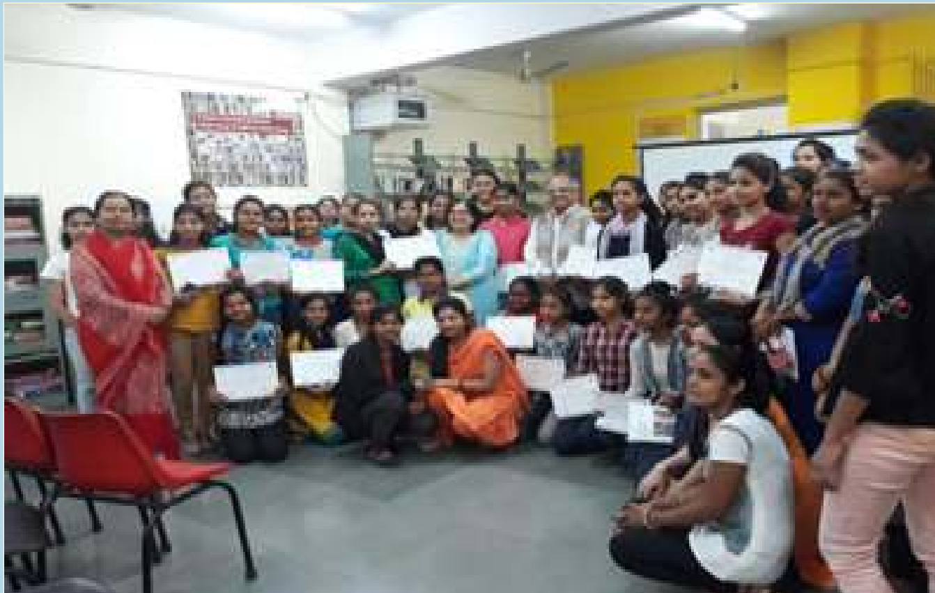
JSS Certification Distribution in VTC Mumbai