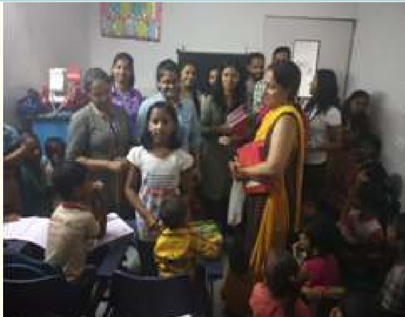
Childrens are telling something like Poem, Story, etc