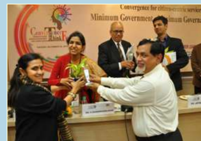
Convergence Think Fest 2014 "Institutionalising Convergence for Effective and Inclusive Governance, From What to How" with Suresh Prabhu, Former Minister Of Railways held at The Constitution Club of India, New Delhi on 26 December 2014