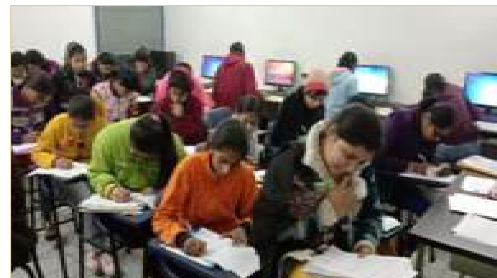
Glimpses from VTC Tikri Khurd

The centres function on a model of voluntary sector and corporate partnership through the element of CSR i.e. corporate social responsibility. The prime objective is to create opportunities for growth and development amongst the slum dwellers, those inhabiting the slums, and families from low income groups engaged in daily wages, casual work, unorganized sector work etc. It has a special focus on families from the scheduled castes.