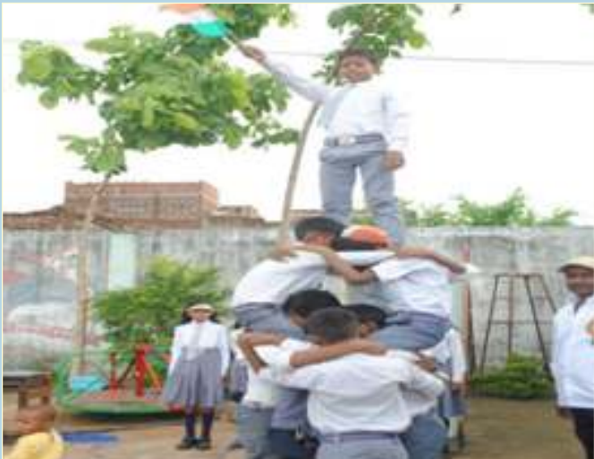
Independence Day Celebrations in Majhui Vasant Panchami Celebrations in Majhui