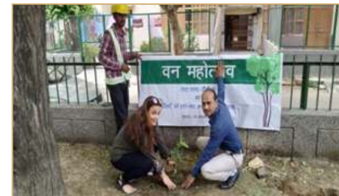
Plantation Drive was conducted at VTC Timarpur on 9 August 2019

NANAK also supports environmental promotion initiatives through tree plantation drives, Awareness Generation programs, and involving community in a community based sanitation approach. Major breakthrough in sanitation has been convincing community members in Bihar to participate in the government programme of building toilets under the Swachh Bharat Abhiyan. Health care interventions also form a part of the focus area of intervention for the community in need. Awareness generation programmes for women and children have been taken up on a regular basis. In order to instil a sense of social responsiveness, children are encouraged to collectively take up social issues such as campaigns against child marriage, alcoholism and gender discrimination. Women are also given platforms for taking up social issues such as sanitation, hygiene, nutrition, etc. Special days such as teachers day, children's day, Gandhi Jayanti etc. are commemorated with special events in the rural areas where NANAK has adopted a hub and spoke model.