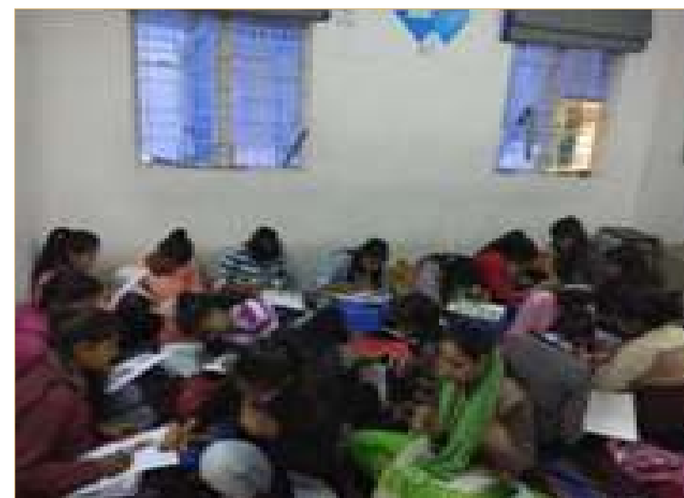
Glimpses from VTC Timarpur