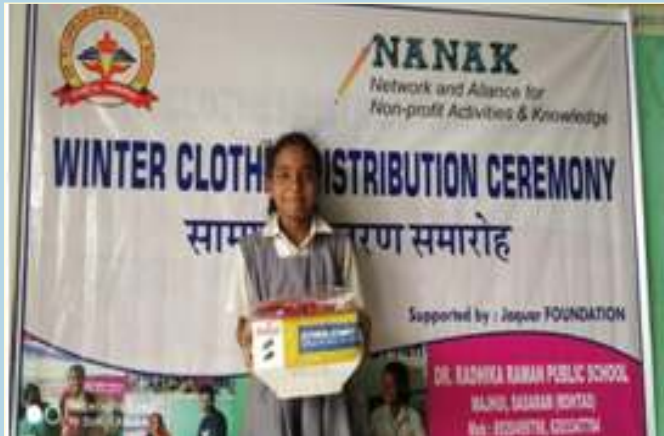
Winter uniform distribution in Dr. Radhika Rama Public School conducted on 4.12.2019