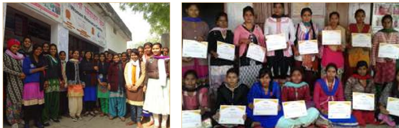
Beneficiaries of Kamta Seva Kendra, Deo, Aurangabad, Bihar

In partnership with Read India, NANAK conducted various capacity development programs, remedial and tutorial classes in Kamta Seva Kendra, Deo. In the year 2019-20, programs such as stitching and tailoring, durry-making, charkha weaving, beauty wellness, etc. were conducted.