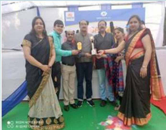
Team NANAk at the Annual NGO Meet