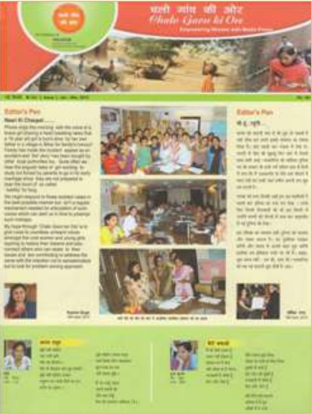
Chalo Gaon Ki Ore