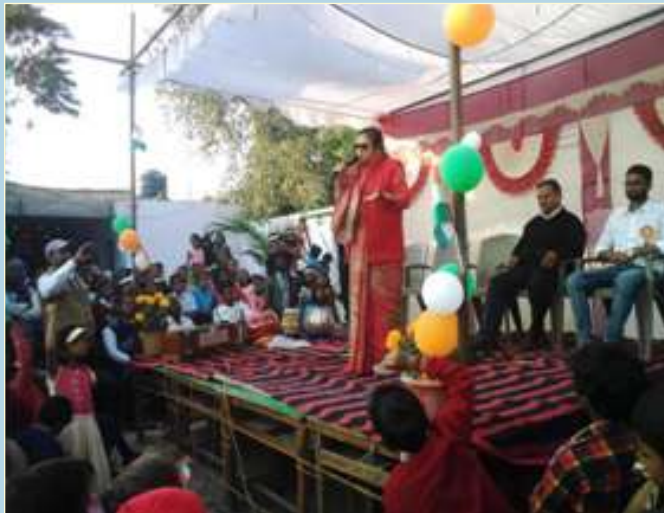
Our Founders at the school for Republic Day Celebrations