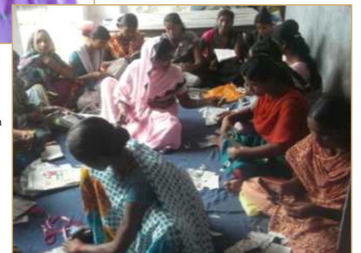
Workshop conducted on First Aid in VTC Timarpur, New Delhi