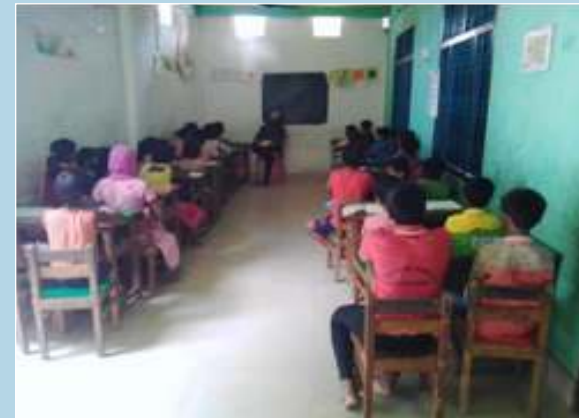
Teachers Day Celebration