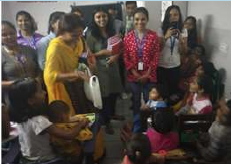
Stationary Distribution to Childrens of Timarpur