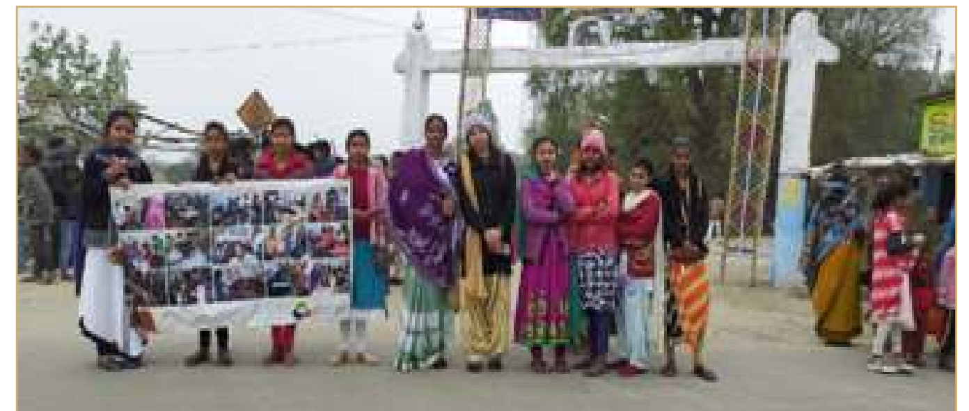
Human Chain at Kamta Sewa Kendra, Deo, Aurangabad, Bihar