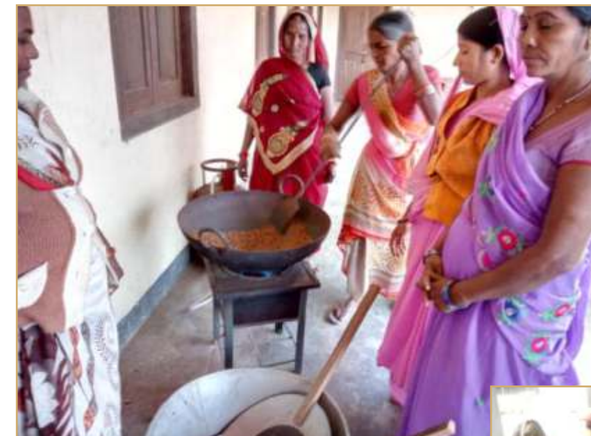
Sattu Production Unit for rural women in Baddi, Rohtas and surrounding areas.

NANAK has partnered with PHD Chamber of Commerce Family Welfare Foundation to support its pioneering programme called 'Chalo Gaon Ki Ore' which a holistic model of empowerment through women as key drivers of the change. NANAK started a Centre at Raipurchor village, Sasaram, Bihar for providing livelihood opportunities to many women in the vicinity throughout 2016. The Centre provided 6 months courses in beautician training and stitching, tailoring, and merchandising. PHD Family Welfare Foundation provided support for running this centre. Two trainers were employed, one each in beauty and wellness and one for stitching, tailoring and merchandising. The Centre provided training to women from disadvantaged backgrounds, at nominal fees to empower them.