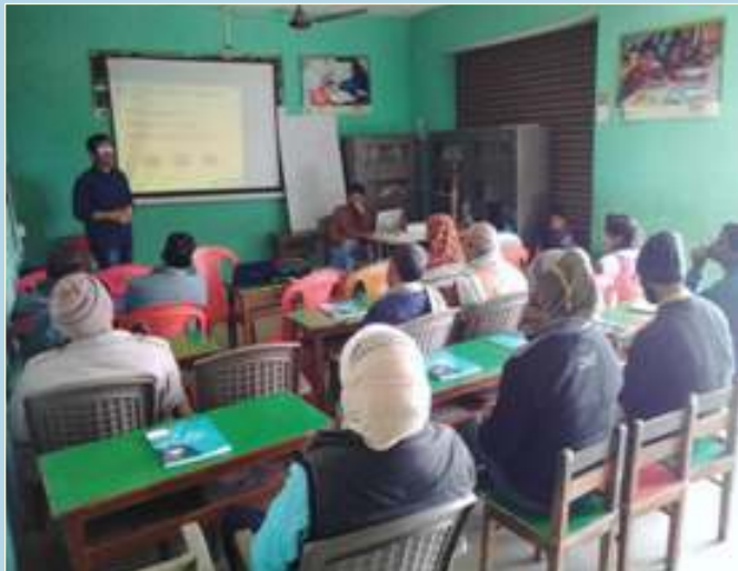
Teacher Training conducted by Ayur Gyan Nyas in Majhui, Bihar