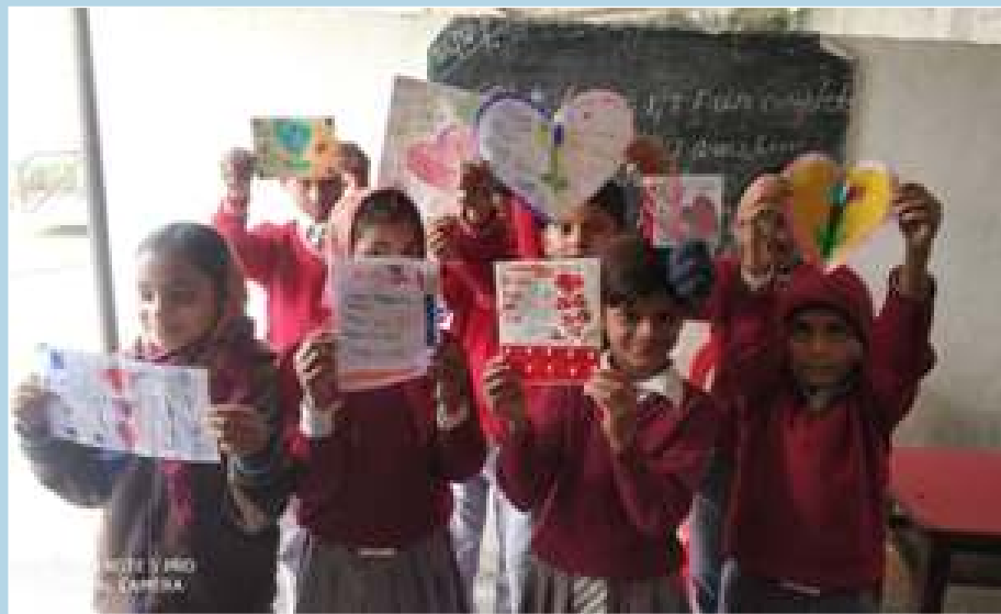
Childrens made beautiful Cards on occasion of Happy New Year