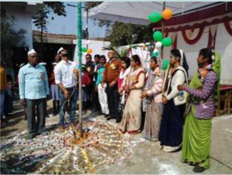
Independence day Celebration at Dr. Radhika Raman Public School, Majhui