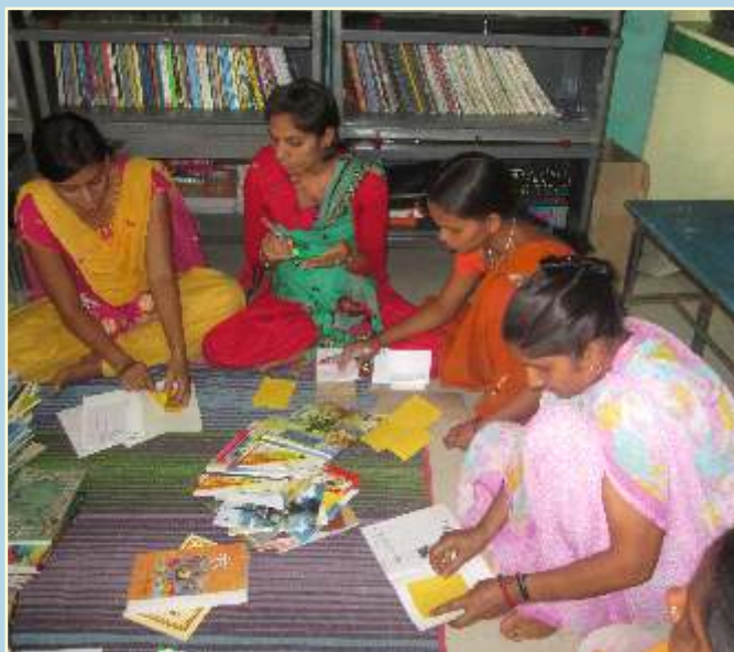
Exam for Beauty wellness & Computer was conducted by Jan Shikshan Sansthan on VTC Timarpur