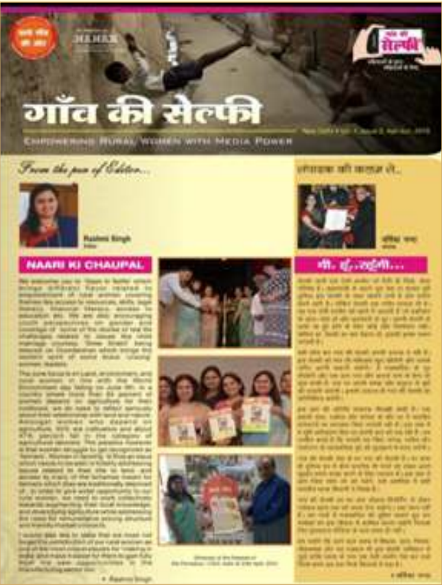
Gaon Ki Selfie

The programmes and projects of NANAK include a life cycle approach and area based convergence approach for early childhood development, primary education, support for higher education to meritorious children from low income groups, skill training, leadership development of women, community awareness on social issues etc. A magazine called "Bal Mukh Kanth" for the children, by the children is also being launched by NANAK on 26th January 2020.