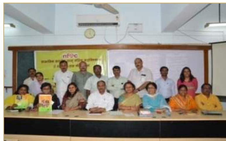
Meeting of Members of NFAC dated 6th April 2016