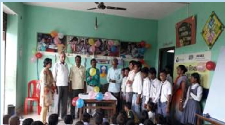
Childrens of Special School Program